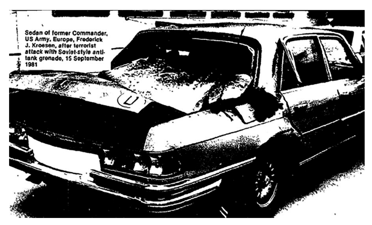
Poverty is not a major factor in creating an insurgence, nor doe material wealth prevent one.... Comparatively wealthy countries with extensive social programs, such as Germany and Italy, are plagued with terrorism, and middle-range countries like Argentina and Lebanon are wracked by insurgent warfare and terrorist campaigns.

we have compact, easy to operate weapons capable of destroying a modern fighter aircraft or tank in moments. Shoulder-fired missiles can destroy helicopters and light-armored vehicles, while slightly larger weapons can destroy a jet fighter or tank.