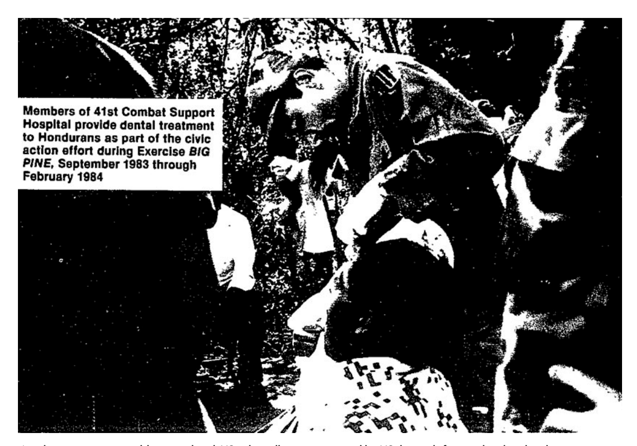
Another area causing problems is cultural. US aid usually is accompanied by US demands for social, political and economic changes the smaller nation may not want, and sometimes the aid is seen as a bribe to ensure compliance. The United States must avoid falling into the trap of being feared and distrusted by the people we seek to help.

To be successful in this mission, we must help indirectly rather than sending US forces into a situation they cannot help. US advisers-military and civilian-must persuade foreign leaders that ultimately it is up to them to restore their citizens' faith in the government. The local government must train and equip its army for small-unit operations, village security support and small, precise strikes against insurgent hideouts.