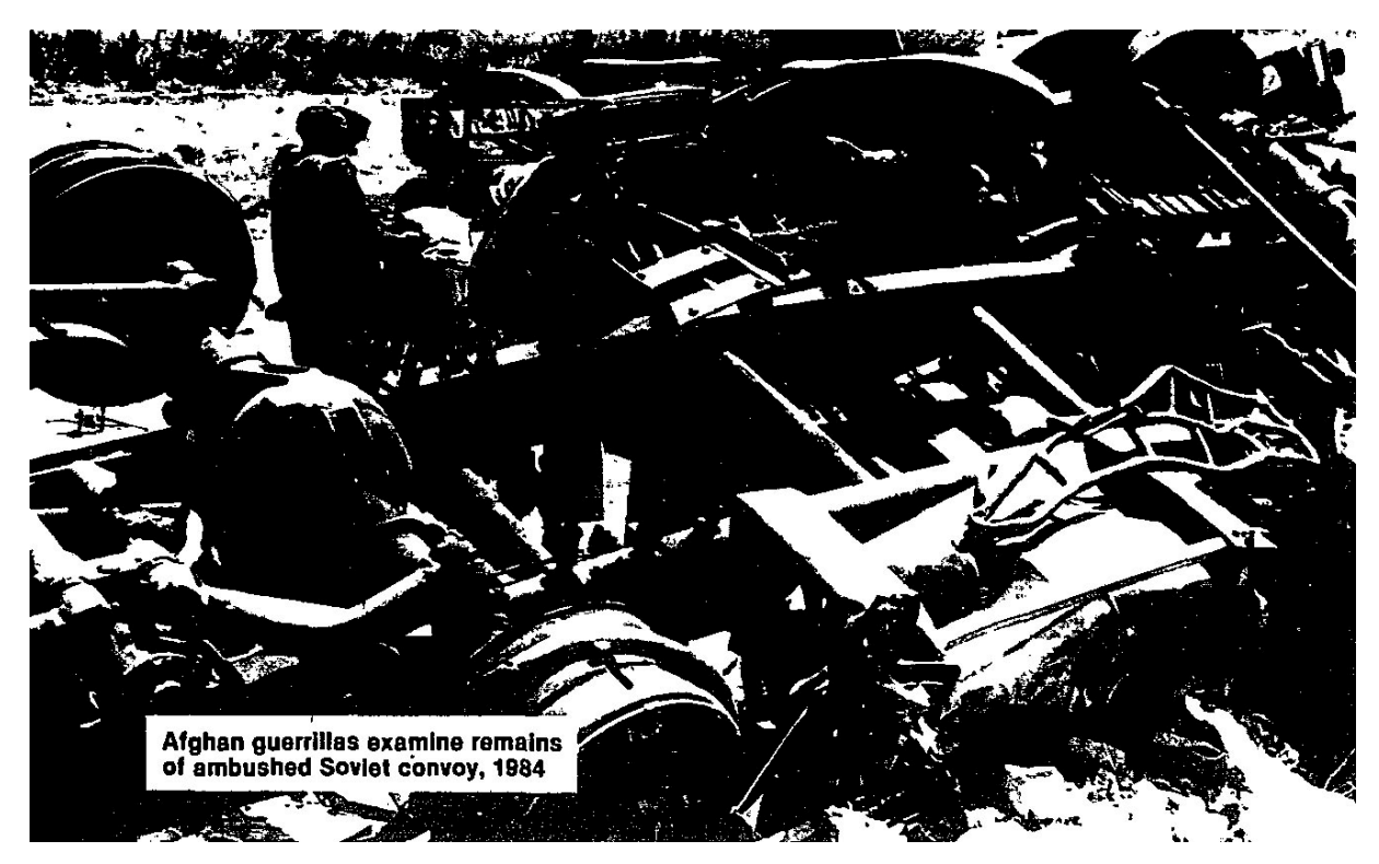
Usually, the United States is called upon to help defeat communist rebels but, increasingly, the Soviets are called upon to defeat anticommunist rebels in such diverse places as Cambodia, Nicaragua and Angola.

passively accept the insurgents among them. This does not mean they support the insurgents-the same apathy can be found in American cities in the face of armed street gangs who have no ideology. What it means is that the government must regain the confidence of the people.