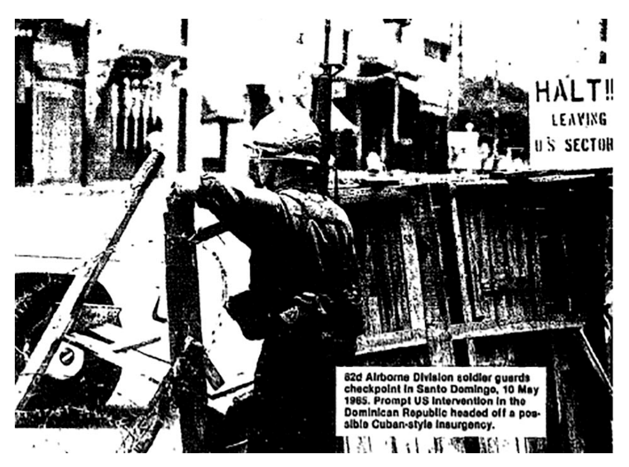
Appropriate action, taken rapidly and resolutely, will normally defuse the insurgency. If the insurgents have little popular support and fail to cause confusion and repression by the government, the insurgency will die.