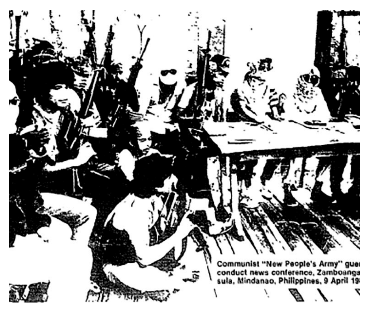
Many insurgents, including the Afghans and the Nicaraguan Sandinistas invite members of the news media to join them 'in the bush,' reporting on their life, activities and dedication to their cause.